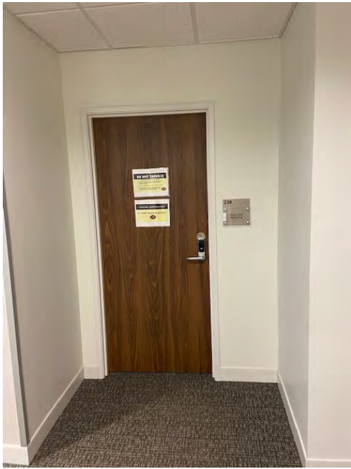
Elevator Lobby Entrance