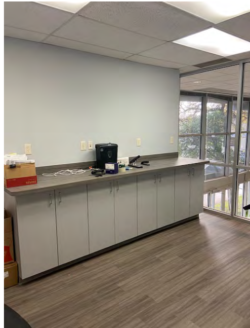
Built In Document Center

Fixtures, Furniture & Equipment is negotiable!