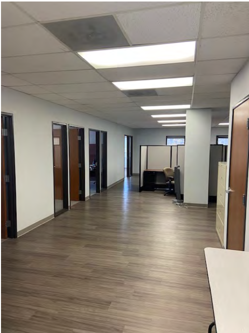
Open Work Area LVT Flooring